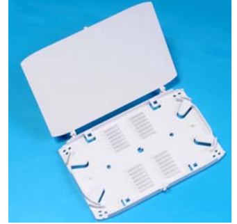
Cable splicing tray –D