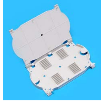
Cable splicing tray –C